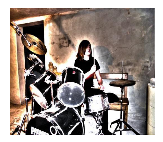
"This how the Chief Musician would like to be seen!"